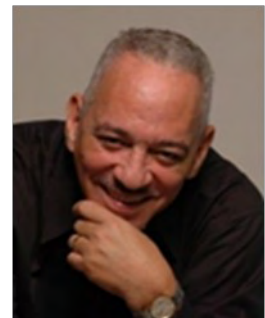
Closing Worship - 3:30p.m. Rev. Dr. Jeremiah Wright Trinity United Church of Christ Chicago, IL

See your Pastor or Church Office for a registration form. You can also print a form or Register Online at www.ccinoh.org !