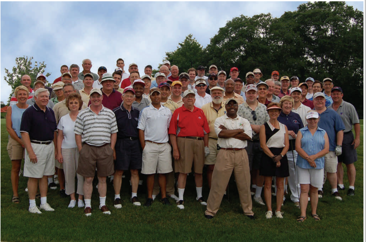
Pictured above are the sixty eight golfers who participated in the Christian Church in Ohio Youth Scholarship Golf Outing